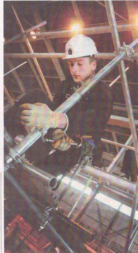
>> UP THERE LIKE A MONKEY A Simian Risk Management trainee at work in the company's new warehouse centre